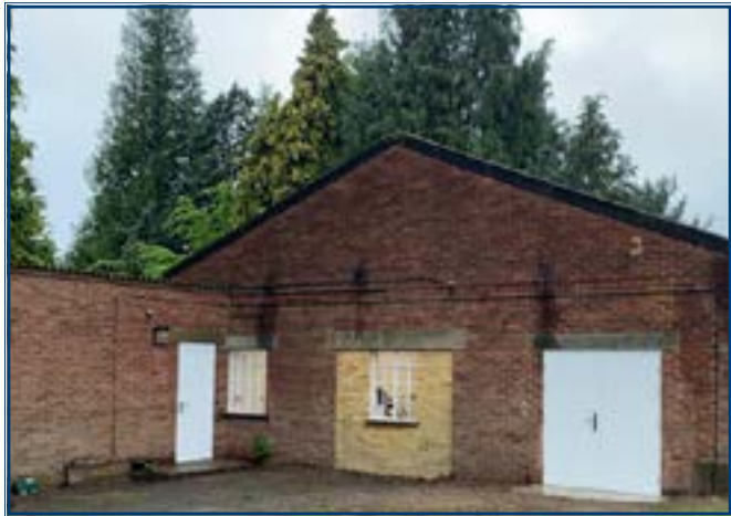
PHOTOS: TOP: THE NEW POND. ABOVE LEFT: THE MANOR HOUSE. FAR LEFT: BEFORE THE REFURBISHMENT AND LEFT: IMPROVED DOORS AND COURTYARD FOR THE IPARC.