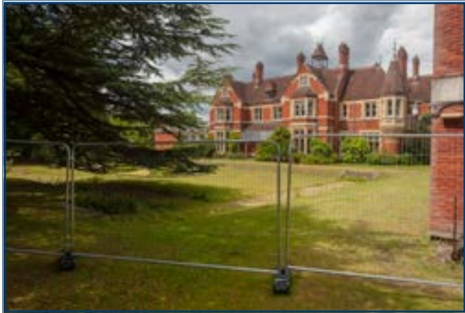
Times and needs change. The manor house at Silwood Park has been sold. The grade two listed building was formerly used for research, teaching and accommodation, but had not been used for some time. The College Endowment Fund, which ensures College assets are realised to further the academic mission, acquired the building and subsequently sold it. The manor house and other buildings included in the sale are now closed off to the rest of the campus, apart from some areas that we continue to lease.