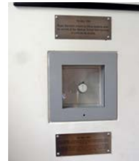
ABOVE: THAT FAMOUS STOPWATCH BELOW: A SCULPTURE AT ST MARY'S, AND A ROWING CLUB SHIELD

The full page photograph at the beginning of this article is of the turbine engine in Mechanical Engineering lobby, taken prior to refurbishment and now reinstated.