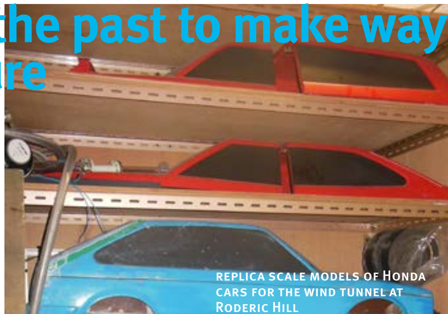
REPLICA SCALE MODELS OF HONDA CARS FOR THE WIND TUNNEL AT RODERIC HILL